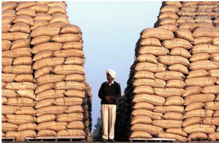
Relevant reforms in agriculture will help the government deliver on its promise of a growth rate in excess of 6 percent.